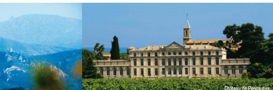
Château de Pennautier

All of our wines bear the Lorgeril signature on the capsule